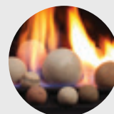
RBCB1 Multi-Colored Cannonballs