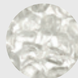
MQG5W White Ember Glass