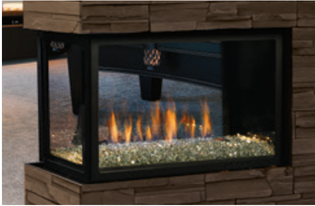
Unit Illustrated: MCV42NHE Peninsula Fireplace – Natural Gas, MP42GT Glass Tray, MQG52G Glass Media – Zircon Ice x (5), MP42PL Porcelain Reflective Liner.