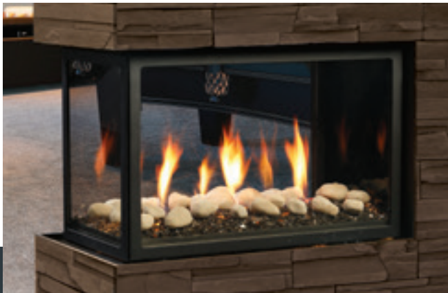
Unit Illustrated: MCV42NHE Peninsula Fireplace – Natural Gas, MP42GT Glass Tray, MQG5C Glass Media – Bronze x (5), MQROCK2 Rock Set – Contemporary Collection – Natural, MP42PL Porcelain Reflective Liner.