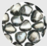
MQG5ZG Zircon Glacier Ice Glass