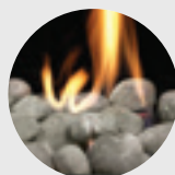
MQROCK2 Natural Rock Set