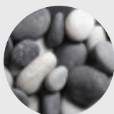
MQSTONE Decorative Stones