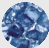
MQG5A Cobalt Ember Glass