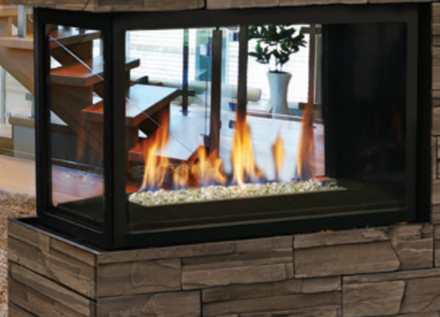
Unit Illustrated: MCV42NHE Peninsula Fireplace – Natural Gas, MP42GT Glass Tray, MQG52G Glass Media – Zircon Ice x (2), MP42PL Porcelain Reflective Liner.

Visit www.marquisfireplaces.net to see the latest evolution in fireplaces.