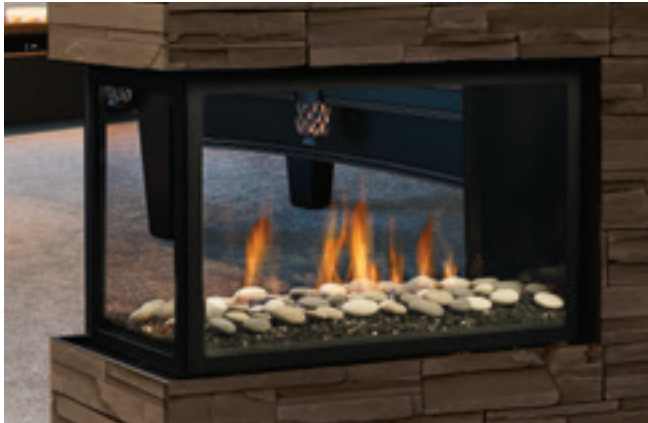
Unit Illustrated: MCV42NHE Peninsula Fireplace – Natural Gas, MP42GT Glass Tray, MQG5C Glass Media – Bronze x (5), MQSTONE Decorative Stones, MP42PL Porcelain Reflective Liner.