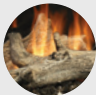
M42LOG3 6 Piece Oak Driftwood Set