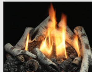
MQLOGF36BW Birch SOLACE II