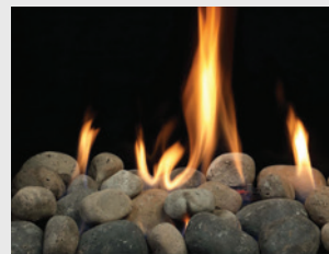
MQROCK2 Multi-Colored Rock Set