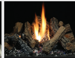
LOGC44 SOLACE II