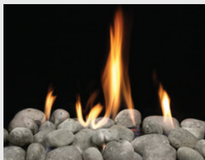
MQROCK2 Natural Rock Set