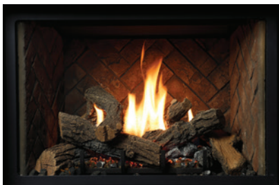
Unit Illustrated: Solace II HBZDV3624N Direct Vent Fireplace MQLOGC45 Log Set (Oak), HB36CVCK Circulating Kit (Designer Clean View), HB36RLH Liner (Herringbone Brick).