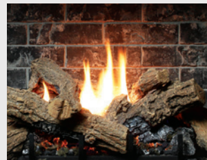
MQLOGC45 Burnt Oak SOLACE II