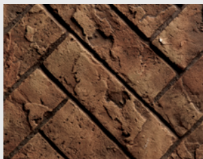
RLH Herringbone Brick