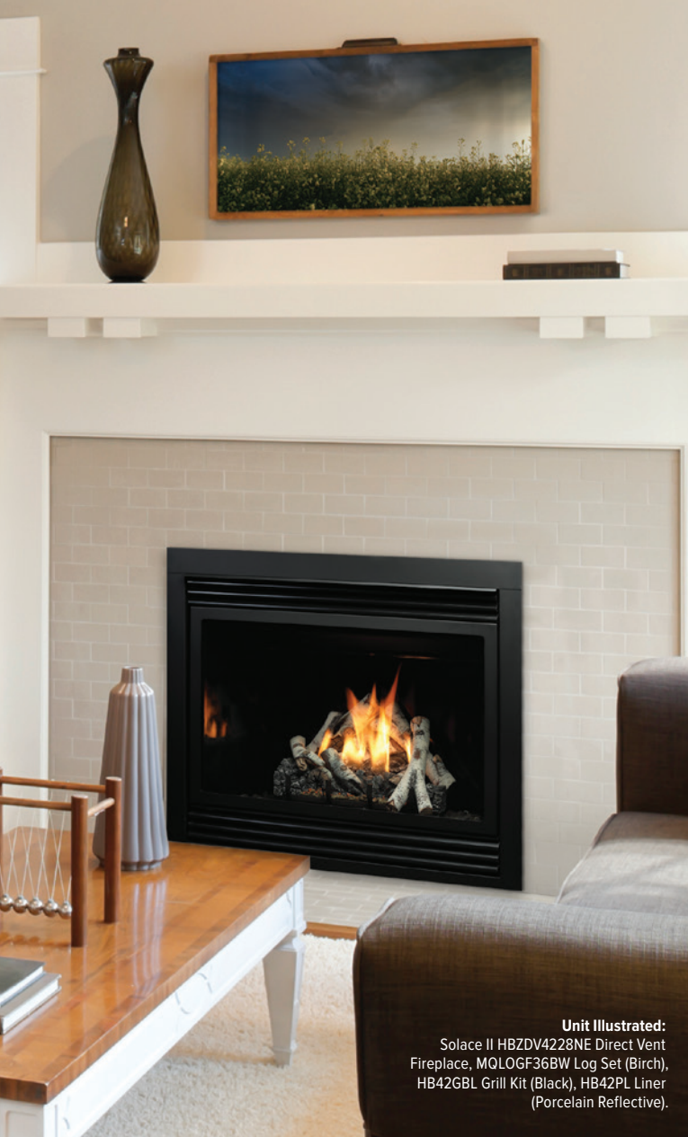
Unit Illustrated: Solace II HBZDV4228NE Direct Vent Fireplace, MQLOGF36BW Log Set (Birch), HB42GBL Grill Kit (Black), HB42PL Liner (Porcelain Reflective).