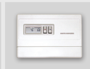
Z80PT Wall Mount