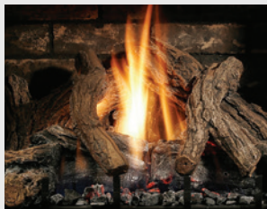
LOGF36 Fibre Split Oak SOLACE