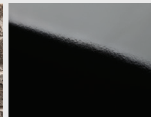
PL Porcelain Reflective

See the latest evolution in fireplaces at marquisfireplaces.net