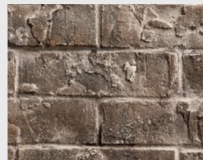
RLT Traditional Brick