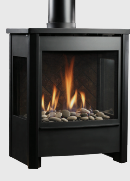
MQFDV453NE2 Free Standing Stove – Natural Gas, F450FBL Door Front – Charcoal with Black Posts, MQ453SDBL Side Doors with Black Frame and Charcoal Panel, MQG5C Bronze Glass (x3), MQSTONES Decorative Stones, MQ451RLH Herringbone Brick Liner.