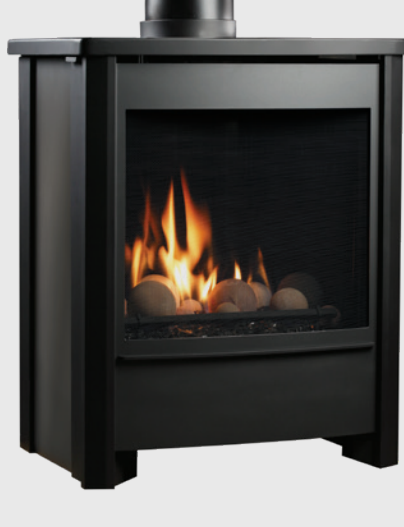
FDV451NE2 Free Standing Direct Vent Stove – Natural Gas, F450FBL Door Front – Charcoal with Black Posts, F451SDSBL Side Doors – Solid Charcoal Panel with Black Frame, MQG5C Bronze Glass (x3), RBCB1 Cannonballs, F45L6 Log Grate.