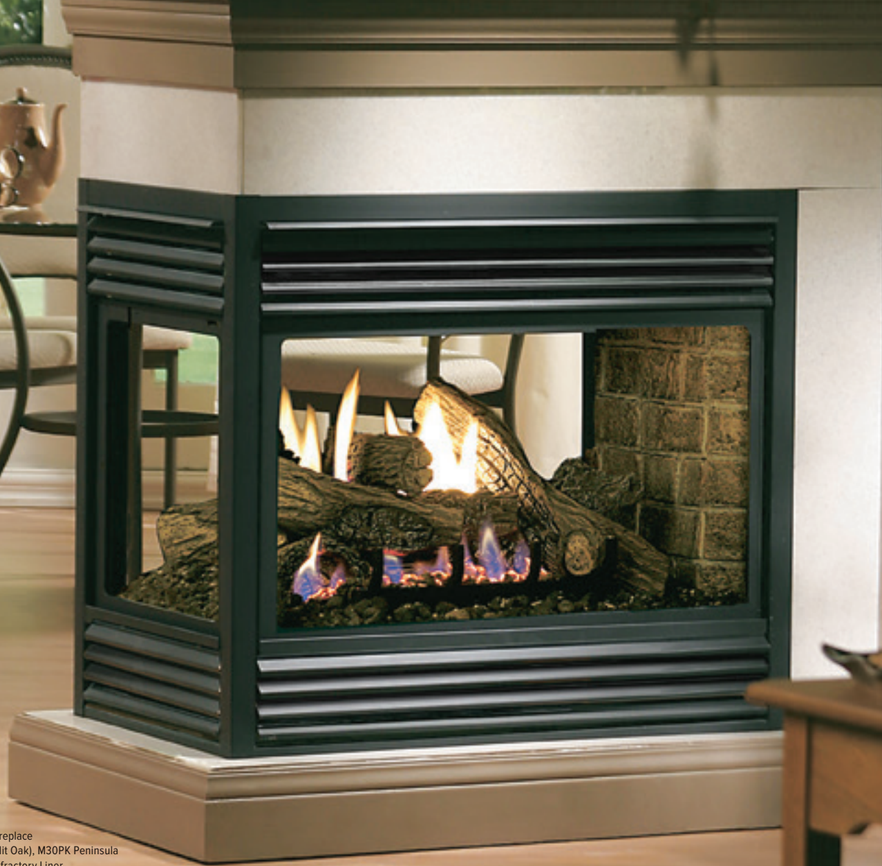
Unit Illustrated: MDVR31N Multi-Sided Direct Vent Fireplace (Natural Gas), LOGC31 Log Set (Seven Piece Cast Split Oak), M30PK Peninsula Kit, MGPKBK Grill Kit (Black), optional MDV38RLE Refractory Liner.